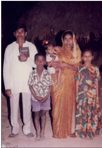
Above: his family Below: preaching at "church" in front of his house

Lest you think that it is only in the Middle East that we distribute Bibles, I have printed these two letters from some of our Indian preachers. I think you will find there testimonies to be fascinating. The Final Frontiers Society exists solely for the purpose of raising funds to purchase and distribute Bibles and Scripture portions to those who need them and desire them, but are either unable to afford a Bible or have no legal access to a Bible. We often think that refers to only new converts or unsaved people who are interested in learning about Jesus, but did you know that many, and perhaps most of the Christians in the world today have never owned a Bible. In fact, they probably have never seen or touched a Bible. Doing so to them, is a dream they never expect to be realized. We're trying to change that through our network of distribution and smuggling and it is only by your generous gifts that we are able to do so.