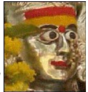
Yelamma, also called Renuka

Note: This is just one of several gods to whom children are offered as temple prostitutes. We are investigating now the possibility of supporting such children through our Touch A Life program.