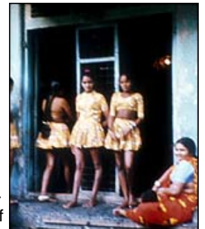
Some of the girls working in a Bombay brothel. Their earnings go to their temple owners.