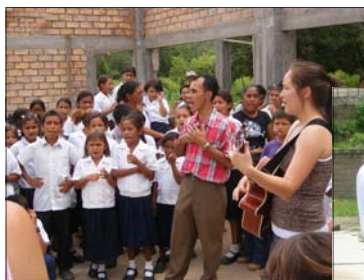
Singing with kids at the feeding center

I had a great time with these guys and look forward to hosting them again next June. We also have another group scheduled for June but July and August are wide open. If you would like to have a group from your church come or just come on your own with a mixed group, give me a call. No matter how many missions trips you have been on, this will be a trip that will change your life forever. And just for the record, these trips are for everyone, even you seniors and younger kids if they are accompanied by a parent.