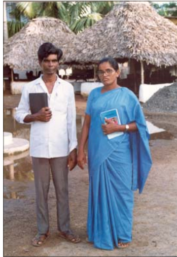
Above: he and his wife Below: passing out Bibles

saved. Like this I think I will be able to reach many people.