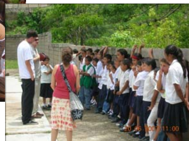
Witnessing at the public school