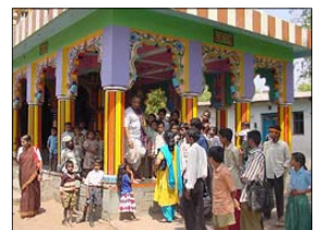
Young girls brought to a temple for dedication.