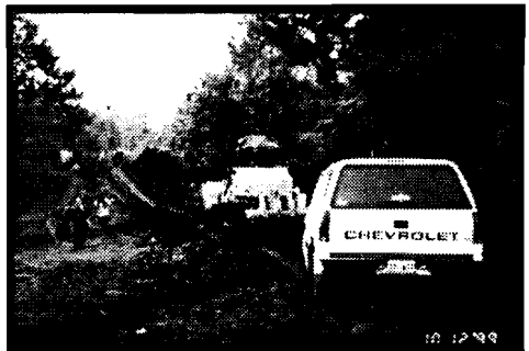
A pickup carrying the food, is only able to pass through the thick, wet mud with the help of a tractor.

I wish I could write only good news in this letter. So I'll start with the good parts. Yesterday a group including Manuel took two vehicles with somewhere between 1 1/2 and 1 3/4 metric tons of food (a metric ton is 1000 kilos, which is 2,200 lbs). They met pastors from two towns at noon in Zacatlan. Angel's pickup truck took a load of food to La Union. They were able to get near that town, but had to haul the stuff over a river by rope. The rest of the men had an interesting trip, which included being pulled by a tractor over a stretch of very wet mud. They got as close as possible to San Andres, where they unloaded the rest. Somewhere between 25 and 35 men carried everything from there to the village (about a 4 or 5 hour hike). They were not able to use donkeys after all, because part of the way is too narrow for a loaded animal.