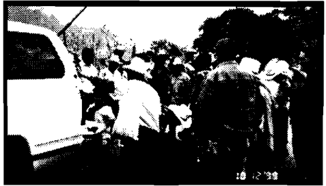
Assistance in the form of beans and corn arrives to the villages where it is urgently needed.