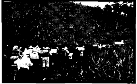
These men will hike 7 miles one way in order to carry food back to their village.