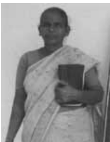
TEAM funds provide for widows and unsupported pastors.

And best of all, if you do not prefer a specific country to assist monthly, we can direct your funds to the country or region in the most desperate need. Either way, it's entirely up to you.