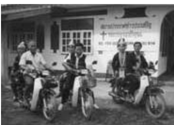
TEAM funds provide for travel to remote and unreached villages through the purchase of ministry tools.