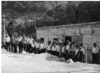
This is a TEAM of preachers working together in Guatemala

TEAM is an acronym for Together - Effectively Advancing the Ministry ; and indicates the relationship between the national preachers in a given country, and those who are sponsoring their ministries.