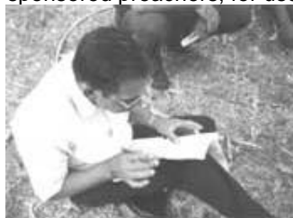
Trimester reports for each sponsors are completed by their supported preachers, then translated and returned to the sponsor.

National and regional directors are appointed from among the members of the advisory and accountability boards of each nation. Such directors maintain a local accountability in the areas of doctrine, morals, and ministry. They also verify all (required) trimester reports for accuracy, before they are translated and sent to their respective sponsors. These reports are required for continued support, unless hindered for geographic or political reasons. In addition, the directors oversee the distribution of cameras which are available to all sponsored preachers, for use in documenting their ministries.