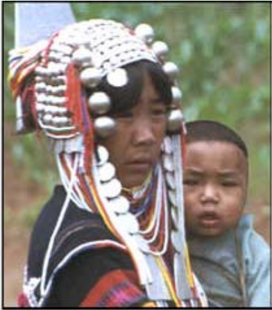
Cover Photograph: circa 1986

The woman in the photo is from the Akha tribe of Southeast Asia. The word “Akha” in their language, means “stupid”. They say they are stupid because at one time they had a book about the Creator, but their forefathers were careless with it, and their dogs tore it to pieces. They call themselves the stupid tribe because “they have lost the knowledge of the Creator.”