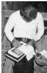
This is a tribal director in Thailand, translating an application into English

compiled, bound and given to the sponsor.