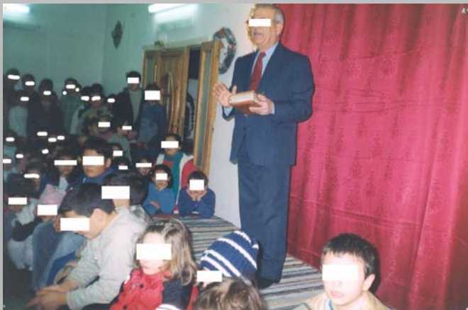
How many Bibles do you see in this underground church in the Middle East? The people pack the "auditorium" up to the platform where the pastor stands, but no Bibles are visible; that is because most of them do not own one.

Churches and ministries will borrow money to build structures but would never consider doing so to support missions. We will spend tens of millions to build a new church facility for ourselves but cannot give $1000 to build one for a church in India. I was told by one of our representatives of a church that cancelled his meeting because they could not at the moment afford to have a missions speaker; yet the pastor went on to tell him how the men in his church had just spent some $14,000 on a fishing trip and