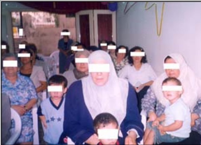
This is the lady (center) mentioned in the paragraph above. Here she is at a ladies meeting with her sons.

door. As he would leave the home, after being invited in to give the gift of a Bible, some of the members would stay behind to evangelize further. One day they happened to knock on the door of this lady, who was now grown and married. Her husband in fact had two wives and would spend a half month with each. When the Bible was offered to her she at first rejected it, saying the Koran declared it was "corrupt", but after a gentle persuasion, she finally accepted it.