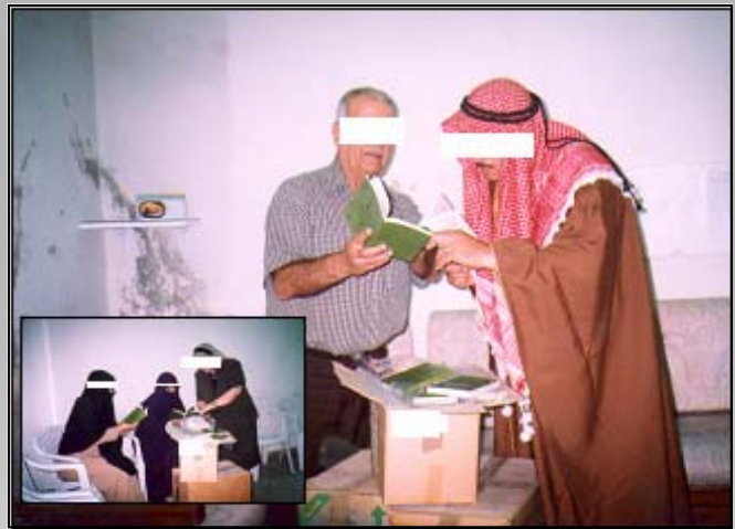
This is the man mentioned above with the pastor. You can see, he had a great curiosity for knowing God's Word. In the inset are his two wives being won to Christ.

This movie by the way, is producing a harvest in the Islamic world. Many nations permit it as a way to show (in their words) the brutality of the "Jews". While they use it as an instrument of hate, God is using it as an instrument of evangelization. You see, many Arab youth are brought up to hate Jesus, even though the Koran praises him. They believe the Jesus we serve is a perverted form of the Jesus we read about in the Bible, thus they have no clear understanding of who he is and what he came to do. This movie is answering many questions for them and creating others. When they stumble upon a Believer, their antagonism has now changed to interest and many are being saved. The movie, tracts, Bibles and radio have sown an enormous amount of