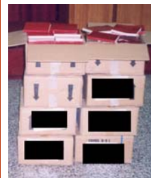
Eight boxes of Farsi Bibles can be carried by a single mule. Each box can be provided for slightly less than $100.00

Our preachers worldwide are in need of Bibles to give out to their new converts and those with questions. Certainly though, pastors and church members need their own copy of God's precious Word. You can learn more of this opportunity by reading our cover story.