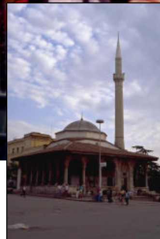
Photo above: Muslims stand in line to attend a Bible Study inside their mosque

Planting churches literally inside Roman Catholic churches, Eastern Orthodox churches and Islamic Mosques (inset right), with the permission of their leaders