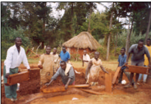
Making bricks for the new church

Praying for your work and love you have for the Lord. I have enclosed pictures to show how we are committed for the Lord's work. Accept greetings from my church members and my entire family. Your faithful servant in the ministry.