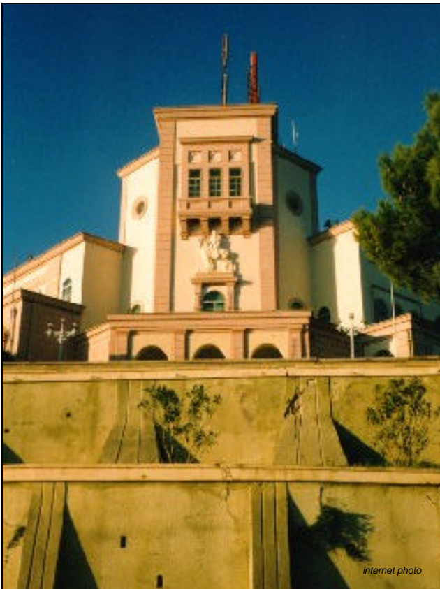
This is one of the most preeminent Roman Catholic Churches in Albania. Another Bible Study group met here with the permission of the Bishop.

As I was about to leave the audience of the Patriarch of Constantinople, he suggested that I visit the Ethem Bey mosque in downtown Tirana (see inset on the cover). The Mullah of that mosque was the highest-ranking Islamic reli-